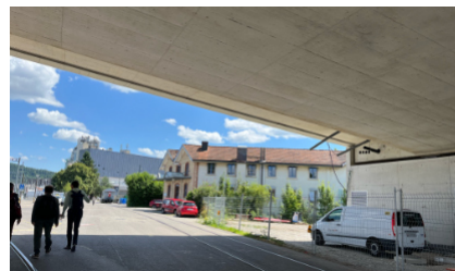
New bridge Winterthur CH

Several workshops were planned for July 10 in Grütze, in discussions with the city of Winterthur: an internal city staff workshop, a workshop with local businesses, one focusing on schools and housing, and the possible inclusion of ZHAW students, either in all sessions or in a dedicated one.