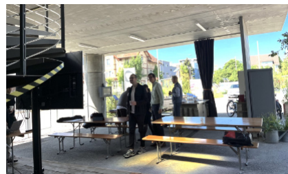
Innovationslabor Winterthur CH