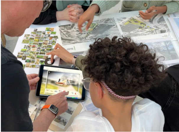
Libellules Vernier CH | OBF Cooperation Partner